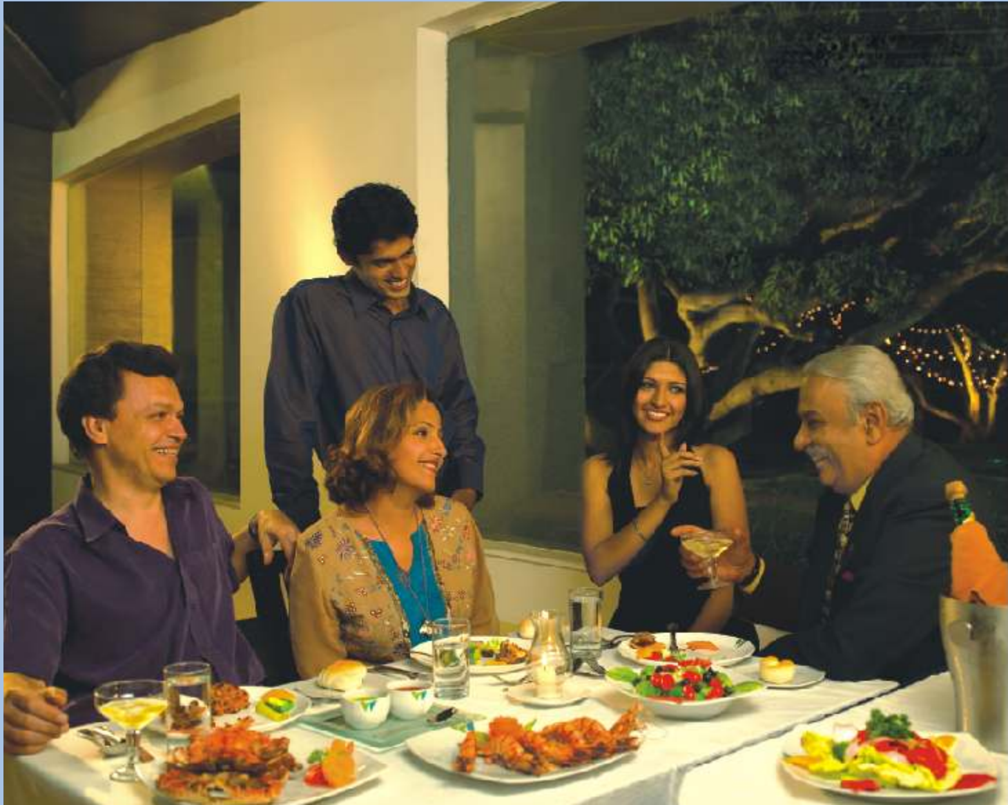
A celebratory dinner in progress at The Melting Pot restaurant. The table overlooks the lit-up central courtyard.

The Woodrose will delight the most discerning palate with its choice of food and beverage options. Whether you're looking for a mellow, multi-course dining experience, a quick cup of cappuccino or the perfect martini, served with flair...The Woodrose has it all.