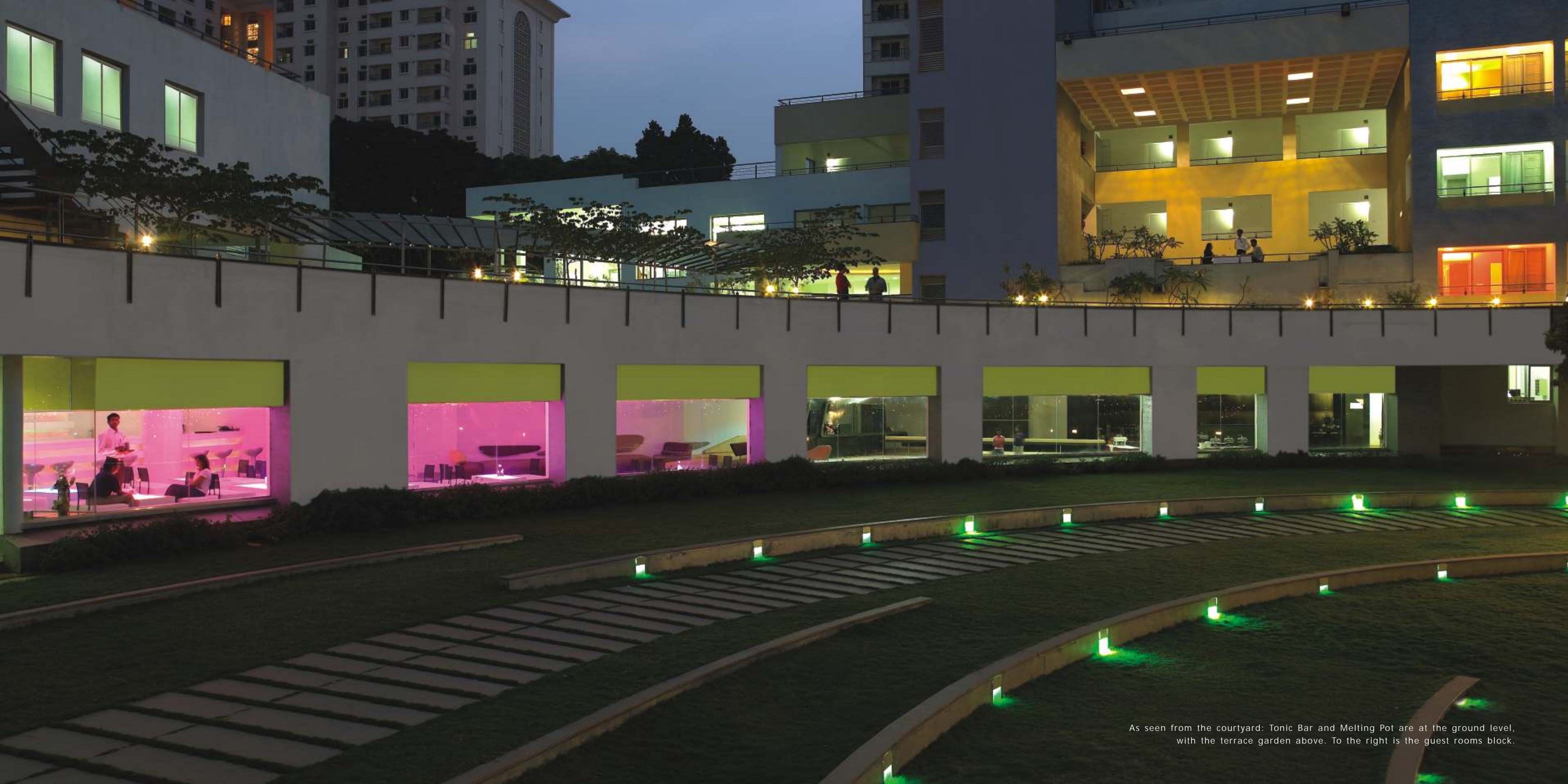
As seen from the courtyard: Tonic Bar and Melting Pot are at the ground level, with the terrace garden above. To the right is the guest rooms block.