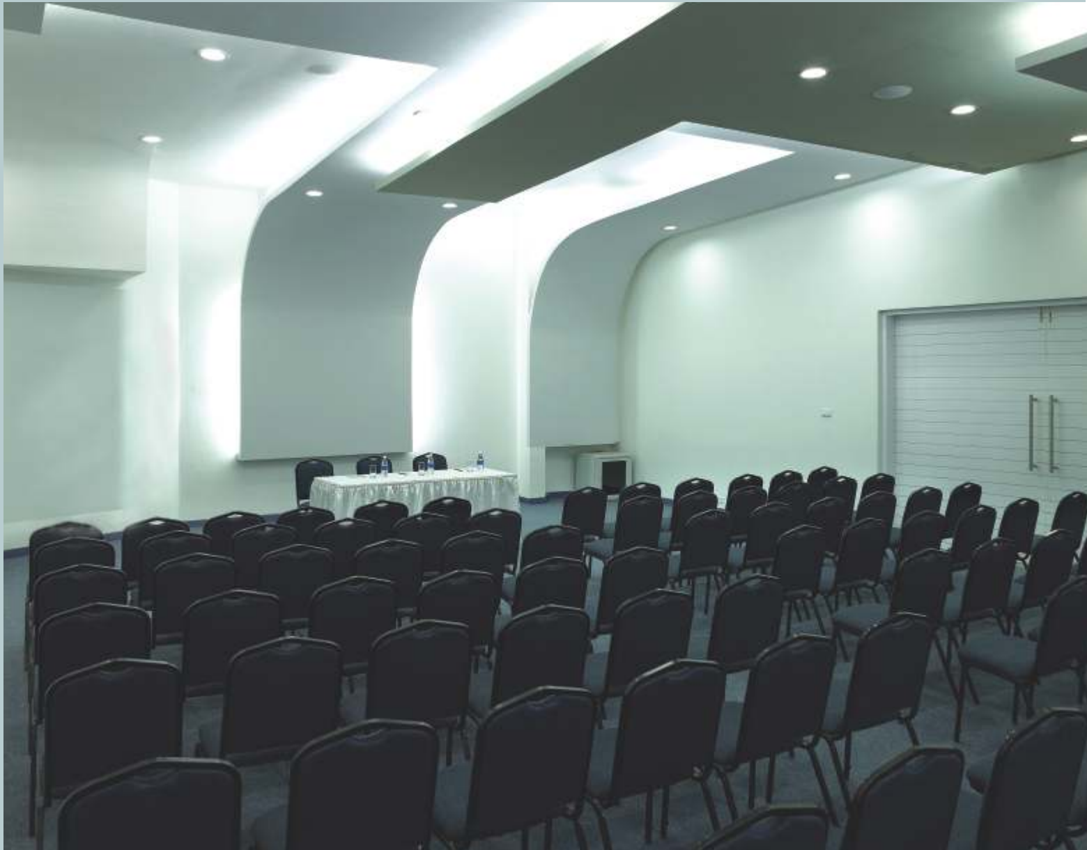
The Blue Room— conference & banquet hall.

MLR Convention Centre Located on Millennium Avenue, diagonally opposite The Woodrose, the MLR Convention Centre has an air-conditioned auditorium that seats 450 people and a banquet hall that can accommodate 500. The convention centre, based on an award-winning design, also has guest rooms, a cafeteria and a media room. Large conferences and conventions can be conducted with ease when facilities at The Woodrose and the MLR Convention Centre are used together.