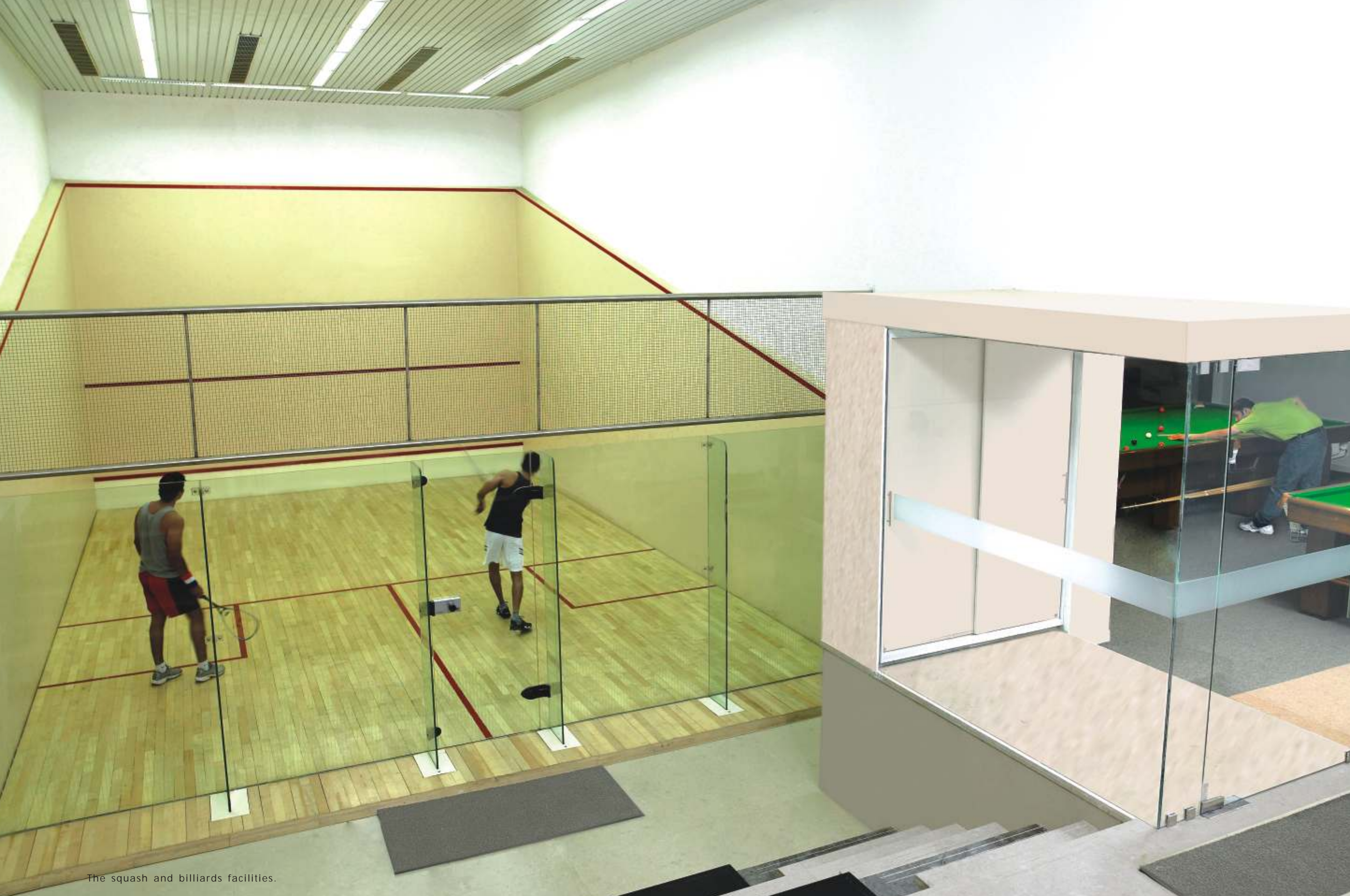
The squash and billiards facilities.