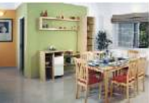
Homestead Serviced Apts and Corporate Residences