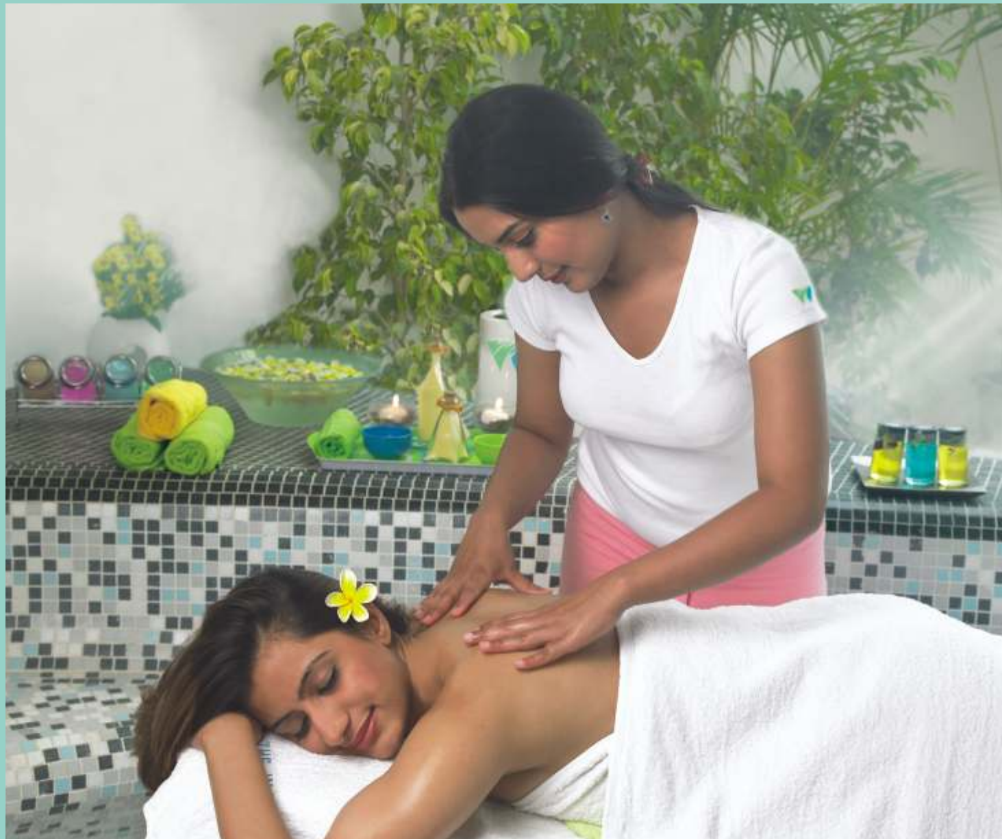
A massage session at

Nourishing health drinks—refreshing and cool—are available at our health bar located near the cardio-vascular gym.