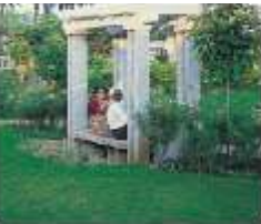
Serenity Retirement Homes