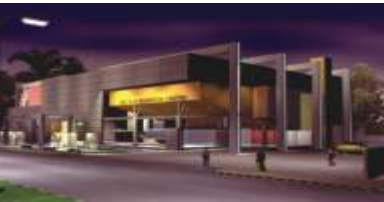
MLR Convention Centre

Brigade Hospitality Services Pvt. Ltd is promoted by Brigade Group, one of South India's leading property developers and an ISO 9001-2000 organisation.