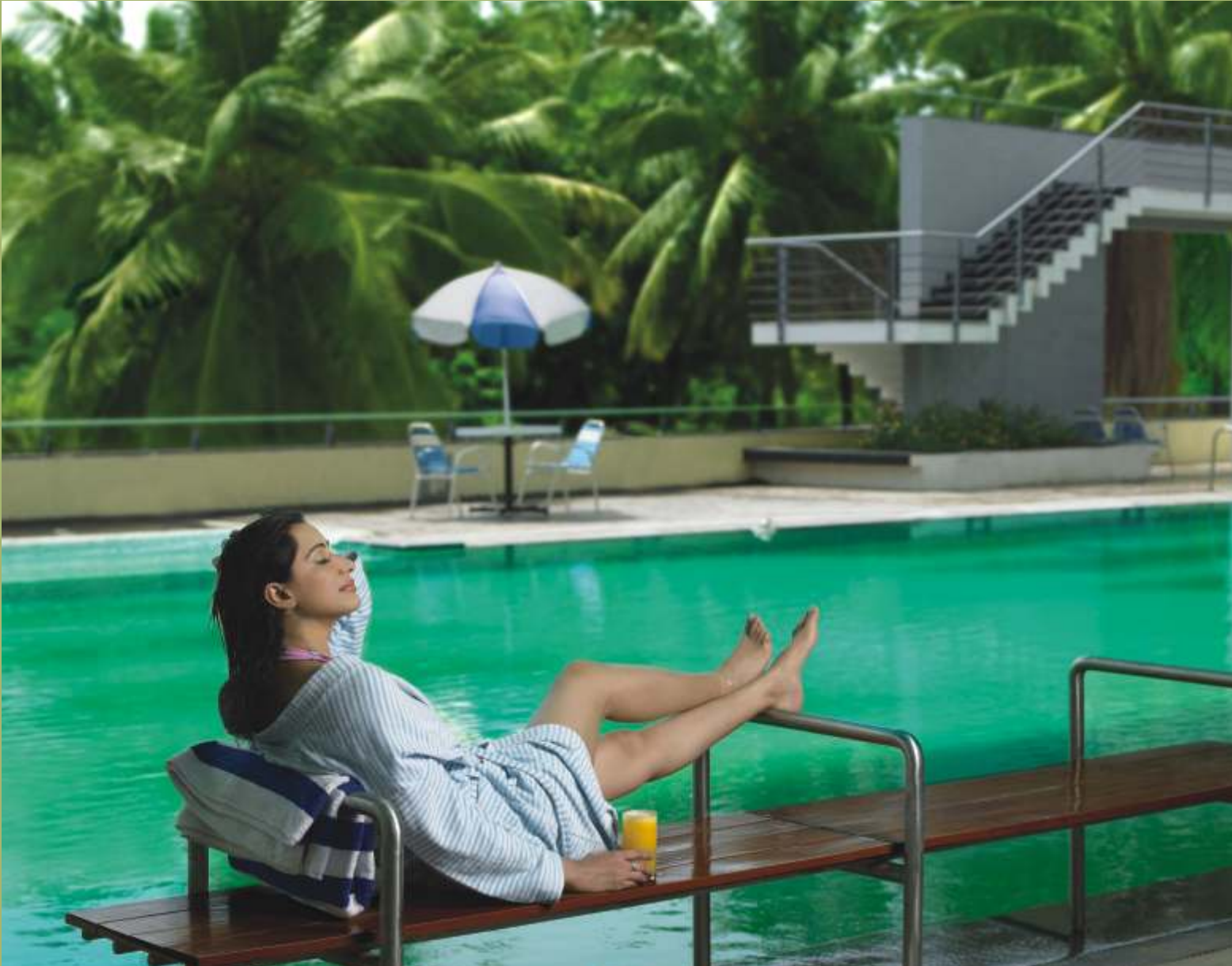
The temperature-controlled swimming pool at The Woodrose overlooks the three-acre park.

Table Tennis The table tennis facility at the club is located in a large, bright alcove, close to the badminton court.