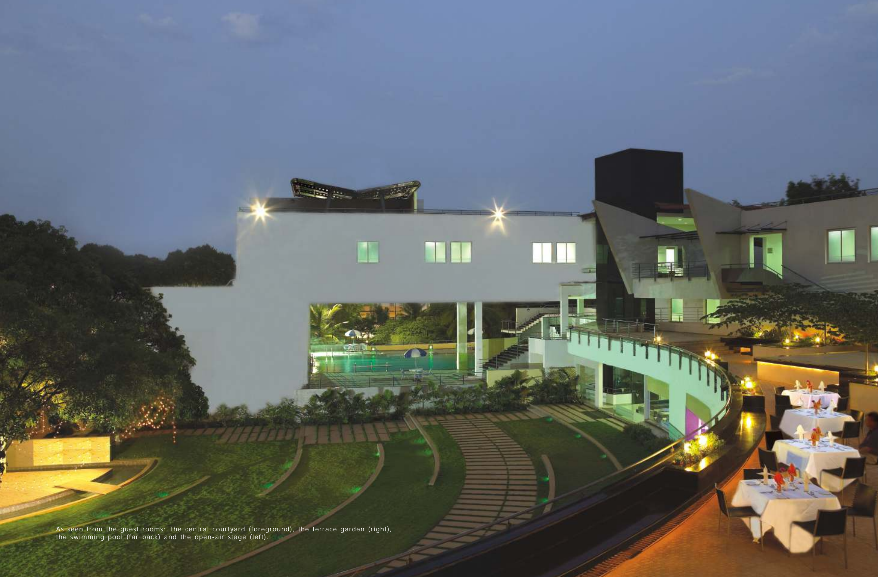
As seen from the guest rooms: The central courtyard (foreground), the terrace garden (right), the swimming pool (far back) and the open-air stage (left).

The Woodrose combines the graciousness of a classic club with tasteful, contemporary design and decor. Based on an award-winning design, The Woodrose is set within a large, green residential enclave—Brigade Millennium—next to a landscaped three-acre park.