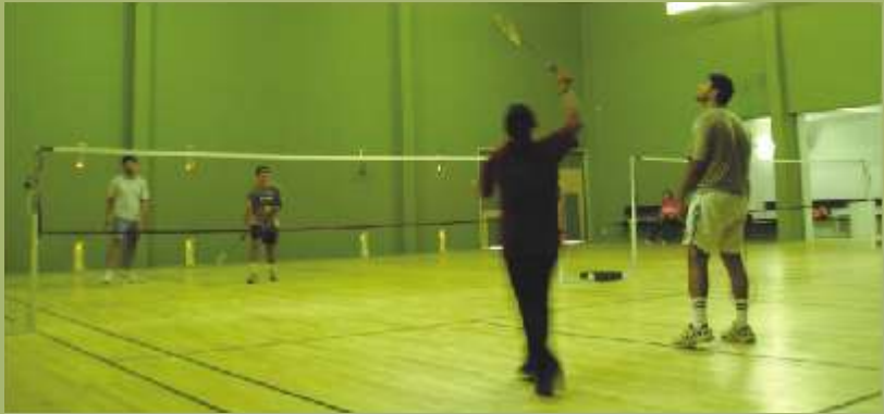
The indoor badminton courts