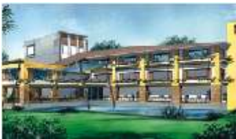
The Augusta Club