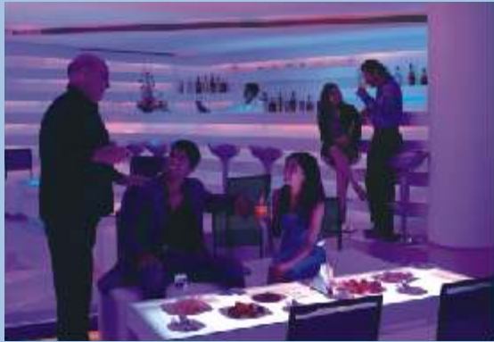
The Tonic Bar and the kitchen at The Woodrose.