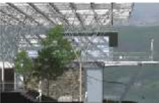
Cascades Hill Resort & Spa