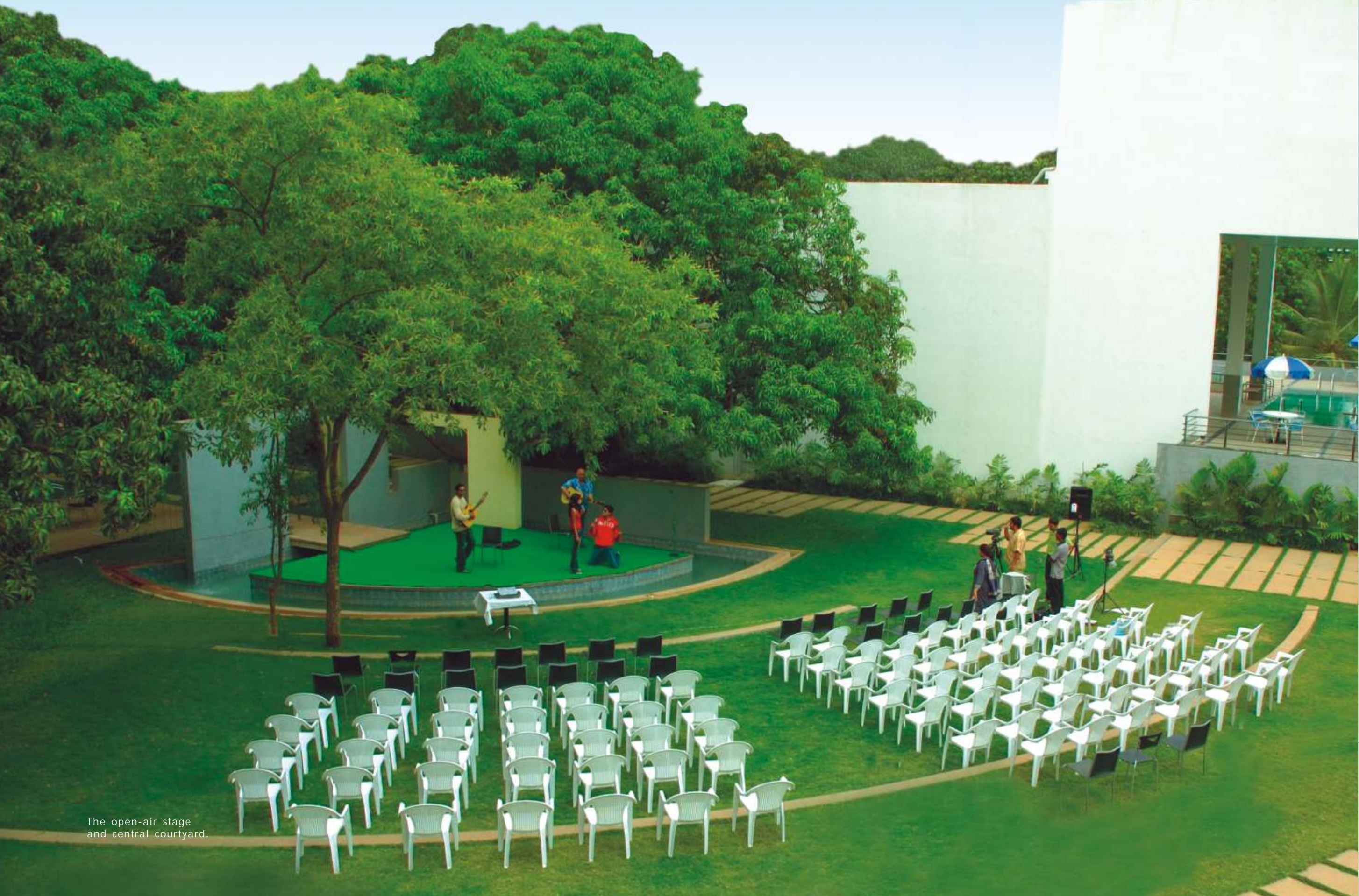
The open-air stage and central courtyard.