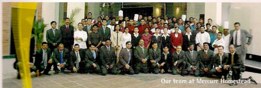
Our team at Mercure Homestead