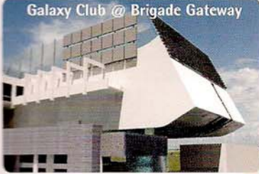
Galaxy Club @ Brigade Gateway