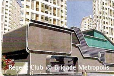
Regent Club @ Brigade Metropolis